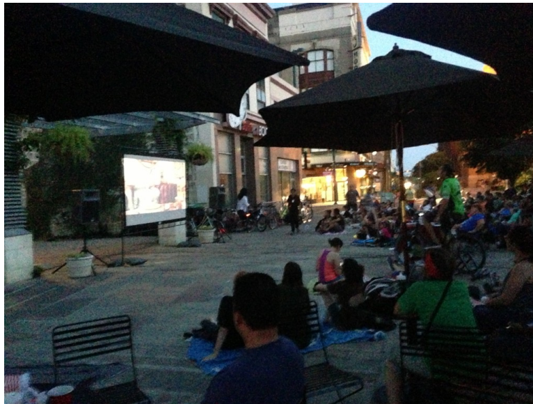
As the sun sets, locals and visitors watch classic films (typically from the 80s) in Main Plaza for Cycle-In Cinema.

This throwback to drive-in movie theaters made its appearance at Main Plaza last month, but the story of its arrival winds throughout San Antonio.