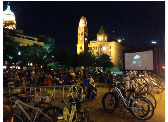
You can never be too careful – bring your bike lock and come early for Cycle-In Cinema to find a good spot to lock up your own "pedal power."