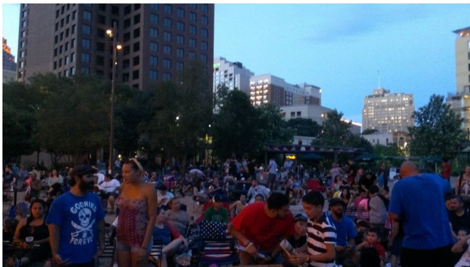
A large crowd gathers for Cycle-In Cinema on a recent Thursday night in Main Plaza.

"I was going to do real small venues," he said. "Then Main Plaza came along. It was like, 'Wow, this is a really huge venue.'"