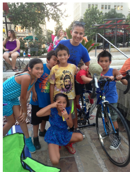
Kids of all ages enjoy an evening in Main Plaza during the new Cycle-In Cinema event.