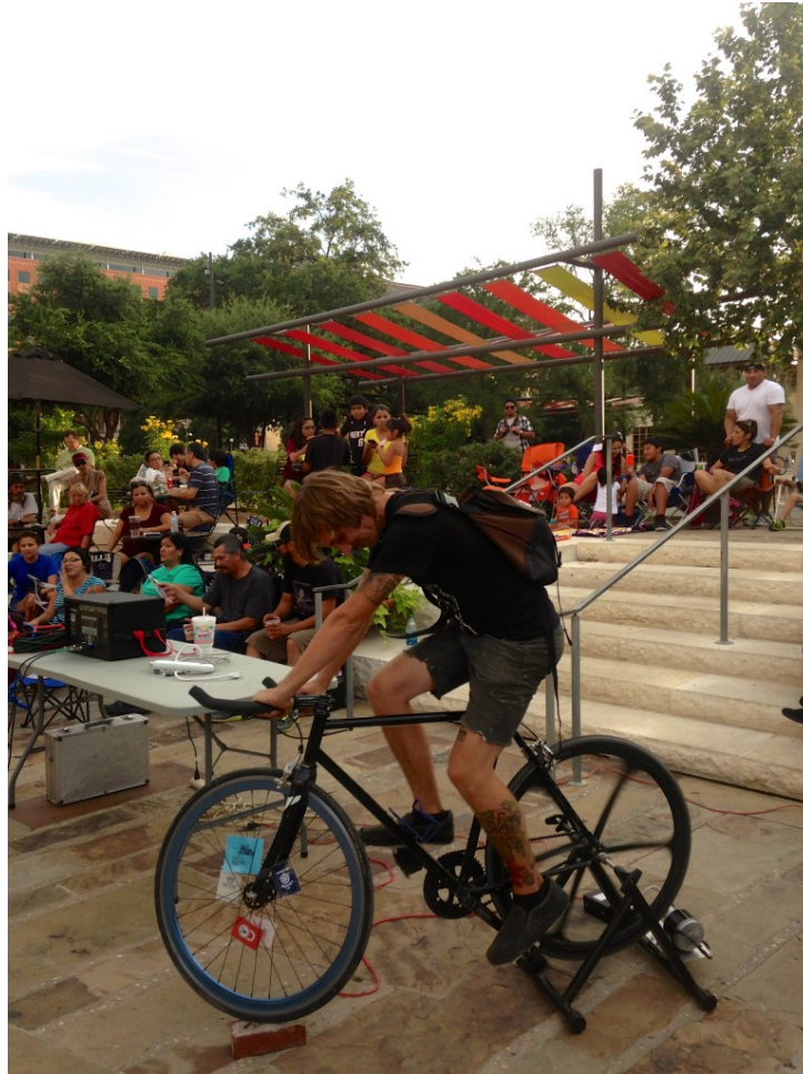
A cyclist powers the SATX Pedal Power projector at dusk in Main Plaza on a recent Thursday night.