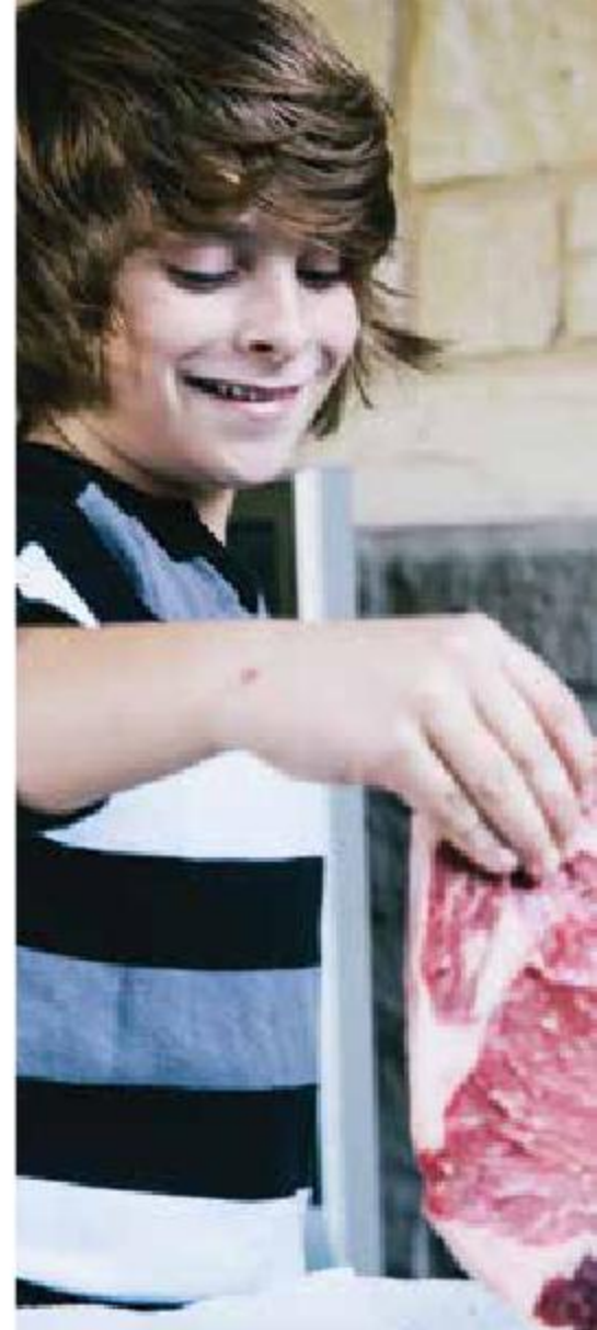
COOKING IN THE FAST LANE

“A BUNCH OF PEOPLE ALL OVER TWITTER WERE SAYING ‘IT LOOKS LIKE RACHAEL RAY HAS A NEW COMPETITOR WITH QUICK MEALS.’”