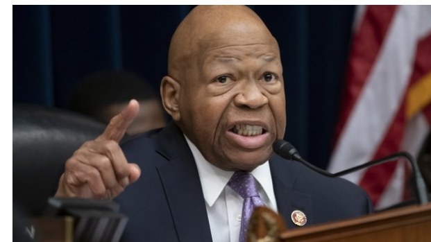
Panel delays deadline on Trump files