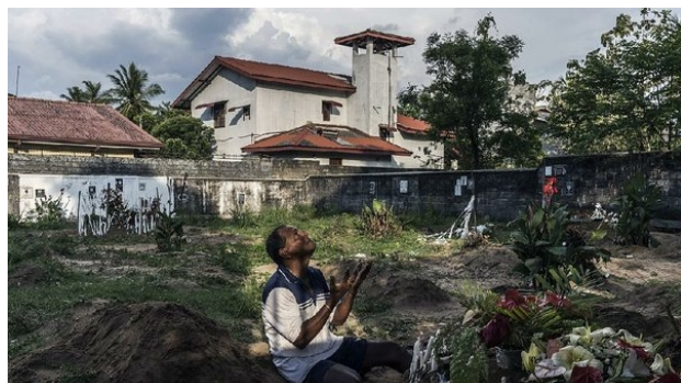
As deaths rise to 359, ISIS claims Sri Lanka bombings