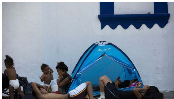
Caravan route less welcoming